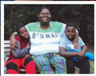
PRISONERS' FAMILY RETREATS