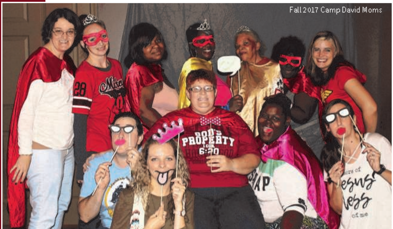
Fall 2017 Camp David Moms